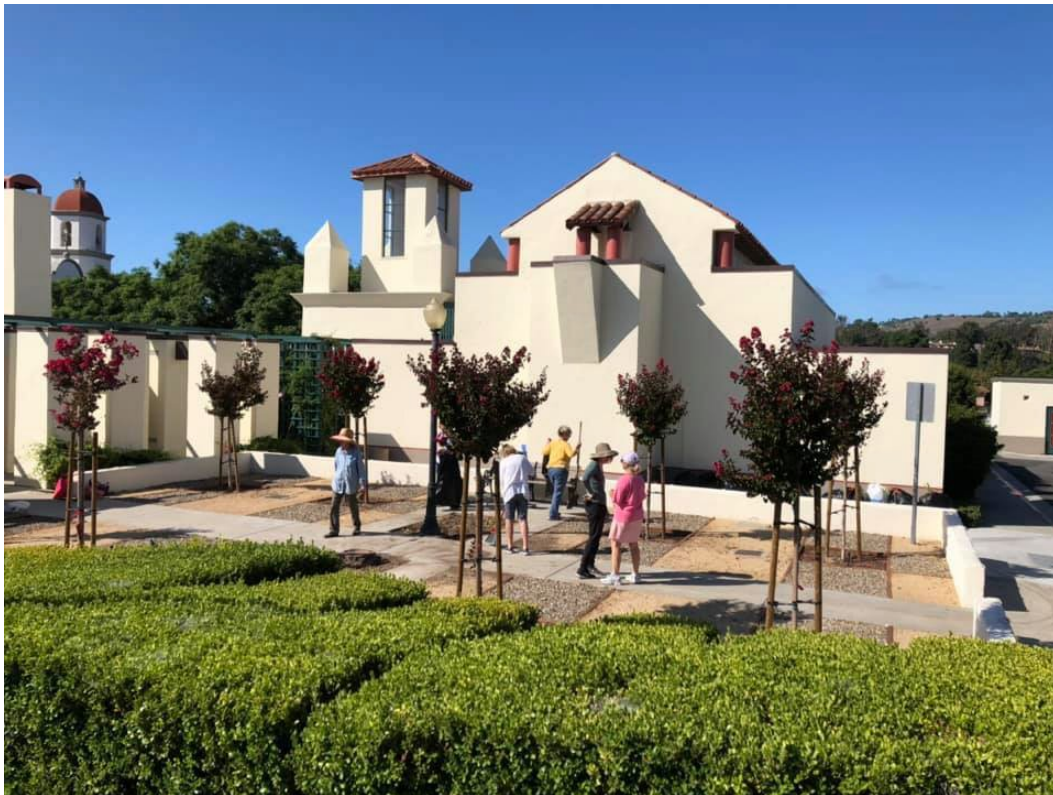
Digging, pulling, and bagging.